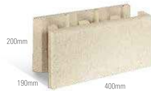
Versasmooth® Standard Unit 12.5 units per m 2