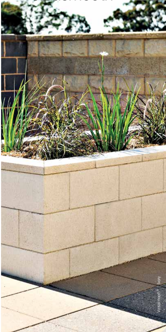
Versasmooth® | Ivory