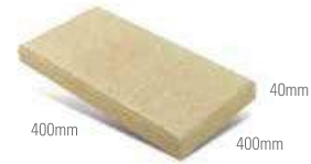
Havenslab® 40 (for capping unit) 12.5 units per l/m

Maximum non reinforced height 600mm+Cap (3 courses) or up to 1200mm with no fines concrete