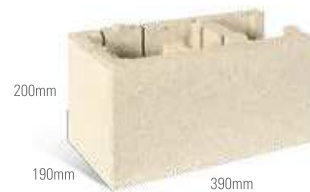
Versasmooth® Corner Unit